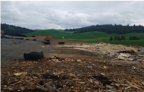
▲ LSI Tier II NMSW Landfill