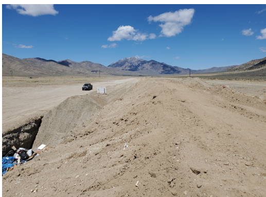
▲ Cell 1 Landfill Closure