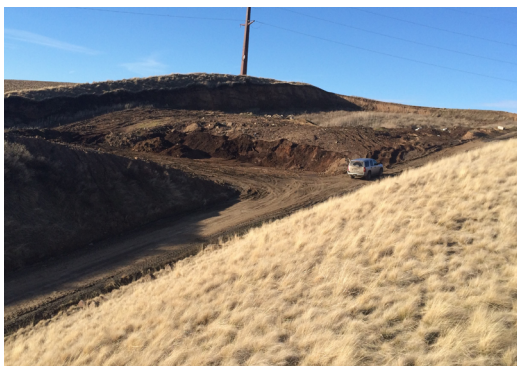
▲ Cell 4 Limited Purpose Landfill

CAROTHERS ROAD SOLID WASTE FACILITY – CELL 4