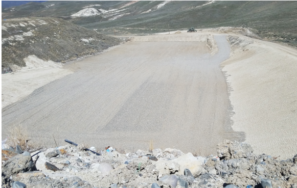
▲ Completed Cell Looking North